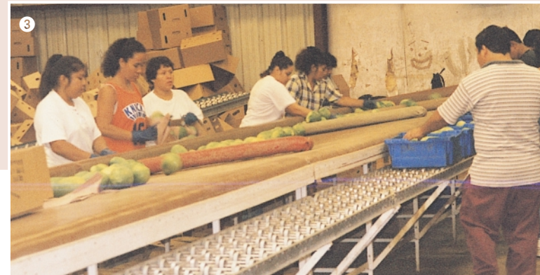
1 Trainee making handicrafts 2 SME development seminar 3 The Product Packaging and Inspection Center Project for Seven Central American Countries