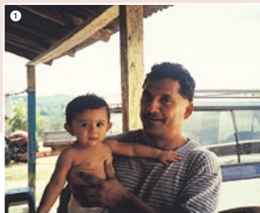
1 Members of the ICDF Alumni Society joined volunteers and cared for children 2 Orphans in El Salvador

Program, the ICDF conducted the Central America Vocational Education Seminar in Costa Rica in January 2001. Participants included human resources development and vocational education officials and other professionals from seven Central American nations. Attendees discussed the development of vocational education systems, and agreed on the future establishment of a comprehensive vocational training center in Costa Rica, to train Central American vocational education instructors and other personnel. It was also decided to establish a textbook production center to supply materials needed for regional vocational education efforts. To put the recommendations of this seminar into action, the ICDF held classes in Programmable Control and Industrial Electronics in Costa Rica in November 2001, training 14 Central American vocational instructors in these skills.