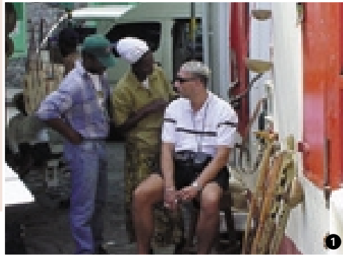
1 Micro-enterprise hair salon in Dominican tourist market 2 Micro-enterprise craftsman