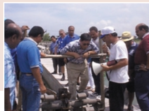
Participants in the Workshop on Fishery Policy and Management for the South Pacific Region

trainees the opportunity to learn from Taiwan's agricultural development experience, and in turn promote agricultural upgrade in their native countries. Graduates can also participate in bilateral agricultural projects and serve as intermediaries in government-to-government contact. Twelve agricultural specialists from nations including The Gambia, Senegal, the Solomon Islands and Haiti have received M.S. degrees in this program, and all have assumed important positions after returning to their home countries. This successful program has now been extended to include doctoral studies in agricultural science, and currently has 17 students enrolled.