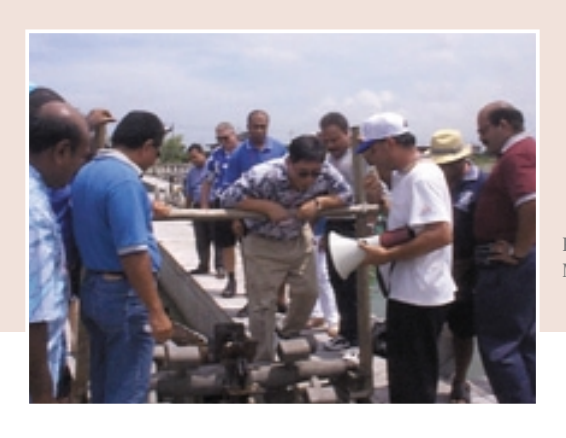
Participants in the Workshop on Fishery Policy and Management for the South Pacific Region