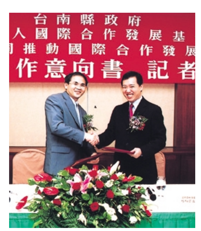
▲ Secretary General Yang (Right) signs a letter of intention with the Government of Tainan County

perform on an international scale. The university strategic alliance program adequately combines the advantages of both the domestic universities (which are constantly facing funding challenges) and the ICDF and serves as a prime example of strategic partnership.