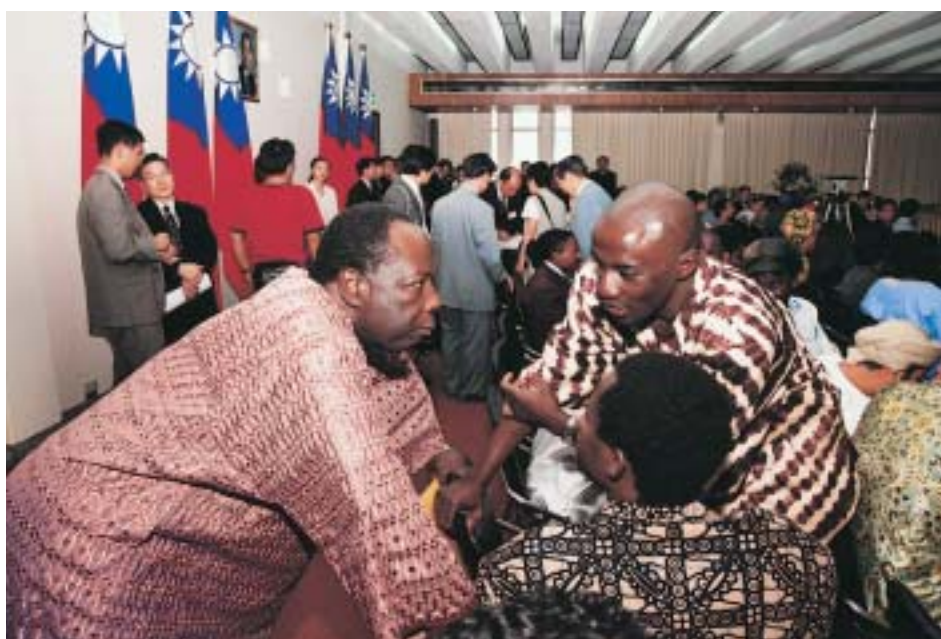
Participants interact during the signing of the ESAIC.

To boost interaction with international organizations and promote third country cooperation and training programs, the ICDF collaborates with international agencies to carry out human resources development training. MASHAV was established by Israel’s Ministry of Foreign Affairs in 1958. Since its establishment, it has trained approximately 175,000 people from 140 countries in the developing world and has undertaken bilateral and multilateral international training programs with a number of organizations. MASHAV provides a point of reference for the ICDF in its education and training programs. In March and October 2002, the former representative of the Israel Economic and Cultural Office in Taipei, H.E. Menashe Zipori, visited