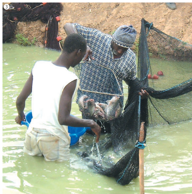
①The ICDF Industry Service Mission in the Dominican Republic provides instruction on ceramics and other industrial arts ②The ICDF provides indirect investment to this factory in Nicaragua ③Local fishermen raise tilapia fish in the Senegal Aquaculture Project