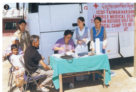
① Farmers in the Haiti Rice Yield Enhancement Project ② Horticultural diversification is the main goal of the São Tomé and Príncipe Vegetable Yield Increase Project ③ Staff members provide medical services to Tibetan refugees at the ICDF-donated Mobile Diagnostic Clinic and Research Center