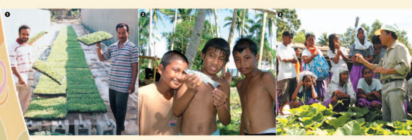
1 The Horticulture Project and Landscaping Project in Bahrain 2 Children in the Marshall Islands showing off their fresh catch 3 A technician from the technical mission in the Marshall Islands introduces the concept of home horticulture to local students

In addition to providing capital, human resource development and training in specialized fields are crucial to carrying out industrial development. The successful development experience of Taiwan's SMEs is well known throughout the world. In order to introduce this model, the TaiwanICDF organizes various seminars and training courses to share Taiwan's achievements with others, including policy planning, trade promotion, and micro-credit. This knowledge is crucial to a country like Mongolia, which is presently transforming into a market economy.