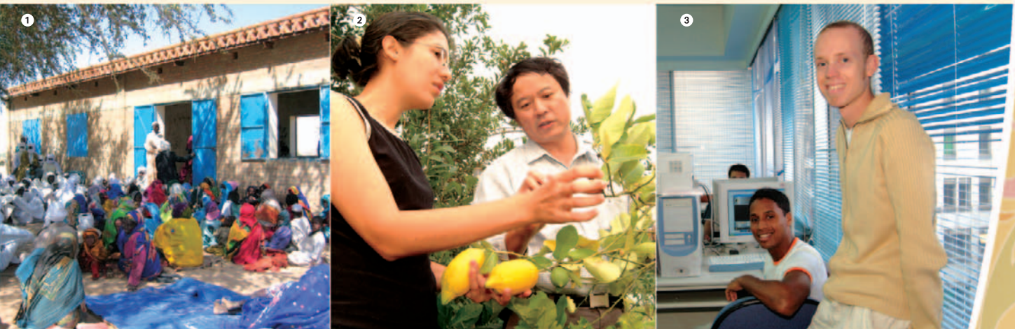
❶ Local patients waiting for treatment provided by the medical mission in Chad ❷ Scholarship programs for students from allied countries facilitate human resource development in fields such as agriculture ❸ Foreign students from the NCCU IMBA Program

The TaiwanICDF, in conjunction with domestic universities, provides scholarships to encourage people from allied nations to come to Taiwan for graduate and post-graduate studies. The Fund also cooperates with local and foreign professional institutes and training bodies in holding seminars and workshops, covering economics and trade, medicine, agriculture, and industrial development. Taiwan's successful expertise in these areas is shared with others, thus promoting international human resource development.