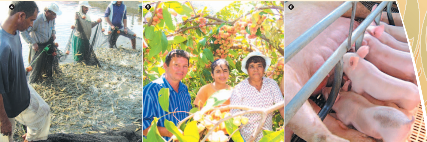
④ Shrimp harvests for the Agriculture and Fisheries Project in Saudi Arabia ⑤ Bell-fruit farmers in the Costa Rica Agriculture Development Project ⑥ Piglets nursing on a sow in the Hog Breeding Project in Honduras