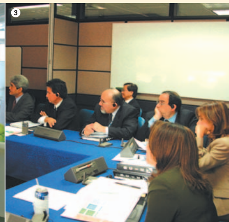
① Local women being provided with vegetable-growing instructions by a technical mission expert in Kiribati ② The Panama Food Processing Project ③ The Central America SME Policy Seminar