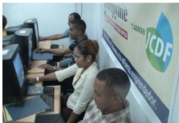
▲ The industry service mission stationed in the Dominican Republic holds a course to teach locals computer skills.