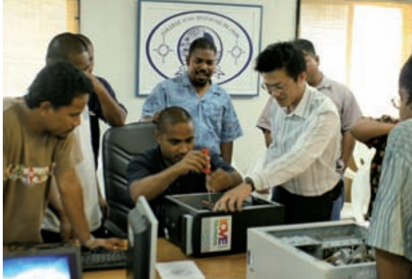
▲ An expert from Taiwan offers instruction in computer assembly to Marshallese students.

An important part of the TaiwanICDF's ICT projects is to raise the ability of partner countries' governments to map out ICT development policies. For example, experts were sent to Burkina Faso for a short period to evaluate the state of that nation's ICT industry and help the government there establish priority development goals and appropriate strategies. Experts have also been stationed in Latin American nations. For instance, policy advisory services have been provided to Guatemala's Consejo Nacional de Ciencia y Tecnología (CONCYT), assisting Guatemala in setting up a dedicated organization to promote ICT development. Specialists also assisted with the Dominican Republic's Program for Micro-, Small and Medium-sized Enterprises (PROMIPYME), promoting the use of ICT among local companies to raise