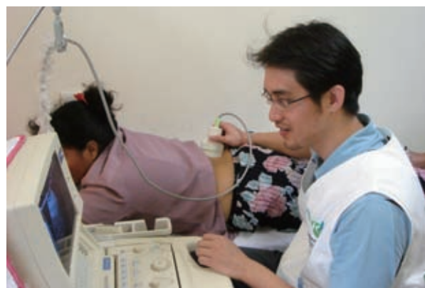
▲ A doctor with a Mobile Medical Mission performs an ultrasound on a woman in Tuvalu.

In December 2005, the TaiwanICDF sent its first MMM to Darjeeling in northern India to provide a free clinic, an initiative which was well received among residents of Nepal and India. This initiative was the catalyst for members of the Taiwan Nongovernmental Hospitals and Clinics Association (NHCA) and the TaiwanICDF to establish the International Healthcare Cooperation Strategic Alliance (IHCSA). The alliance