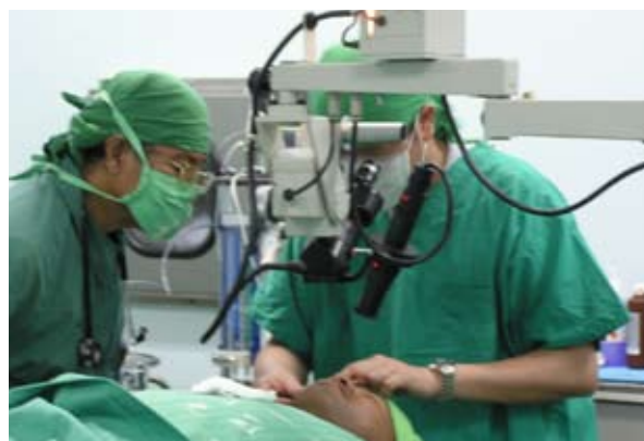
▲ The Mobile Medical Mission visiting Kiribati excises an abdominal tumor from a local patient.

The TaiwanICDF drafts individual development projects based on the aforementioned goals, strategies, and methods, creating a seamless network to implement the projects. A detailed introduction to the goals, strategies, and methods of the projects in the TaiwanICDF's four key areas of cooperation, namely agriculture, private sector development, ICT, and medical and health care, will be provided in the next section of this chapter.