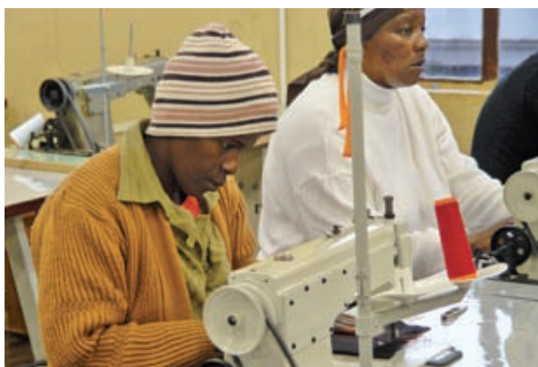
▲ Trainees in Swaziland learn tailoring skills.

In order to better understand the present state and potential of the private sector in partner countries, the TaiwanICDF collects information on their economy, trade, society and education. It engages in policy research and system analysis, after which suggestions are produced and supplied to policy-makers in the partner nations. These suggestions also serve as blueprints for cooperative projects further down the road.