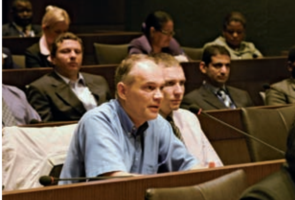
▲ Workshops are held to enable participants to learn about Taiwan's development experience.

and developing nations. The TaiwanICDF draws on this experience to assist partner countries in designing key strategies and methods to establish the foundation for economic development.