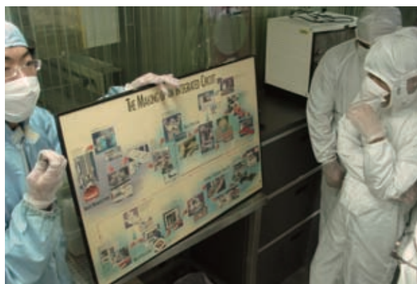
▲ Participants attending a workshop on Bridging the Digital Divide visit a semiconductor laboratory and listen to an introduction to the manufacturing process.

foster development of the ICT sector. The TaiwanICDF also holds short-term training courses and workshops in Taiwan and overseas. Since vocational training and education is crucial to industrial upgrading and economic transformation, the TaiwanICDF has established information networks and hardware at vocational training academies. It has also developed software to successfully support the training required. This not only addresses any