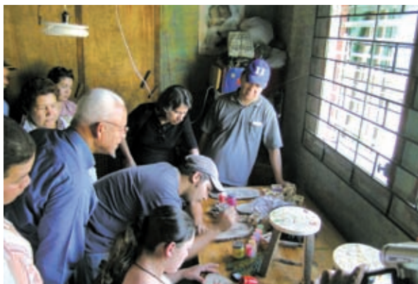
▲ The vocational training project in El Salvador trains the local manpower needed to support industrial development.

Agriculture was the primary foundation from which Taiwan transformed its economy. The next stage was the