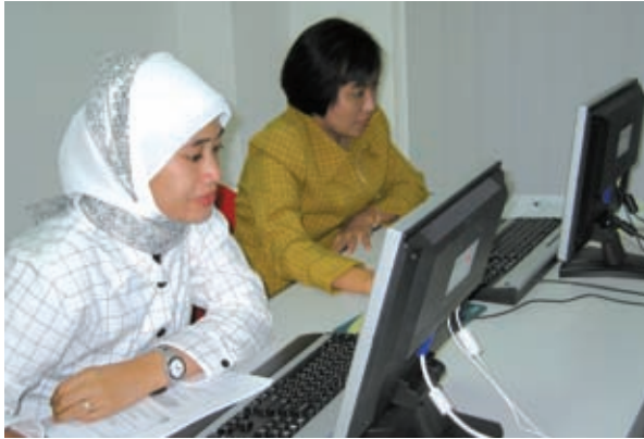
▲ The ADOC Project boosts ICT capabilities in partner nations.

engaging in bilateral and multilateral cooperation on an official development assistance (ODA) level. This limits formal avenues through which Taiwan can provide its development experience to others. As a result, if Taiwan seeks to effectively participate in projects implemented by international development organizations, it must have a clear understanding of the current focus of development assistance, and work in conjunction with global political and economic trends. The TaiwanICDF must incorporate these trends into its core strategies, enabling it to remain in step with international practice. This will help not only to boost Taiwan's cooperative relationship with aid organizations, but also to highlight Taiwan's unique strengths, increase its meaningful participation in international affairs, and develop innovative strategies for engaging in international relations.