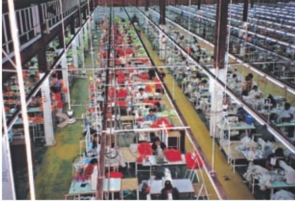
▲ A textile factory in Nicaragua received funding from the TaiwanICDF, helping it to expand operations.

management concepts to partner countries, to foster industrial development.