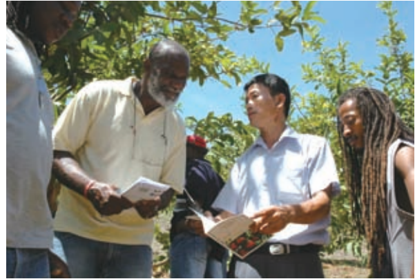
▲ Experts offer instruction in cultivation to farmers in St. Vincent and the Grenadines.

International development cooperation is multi-