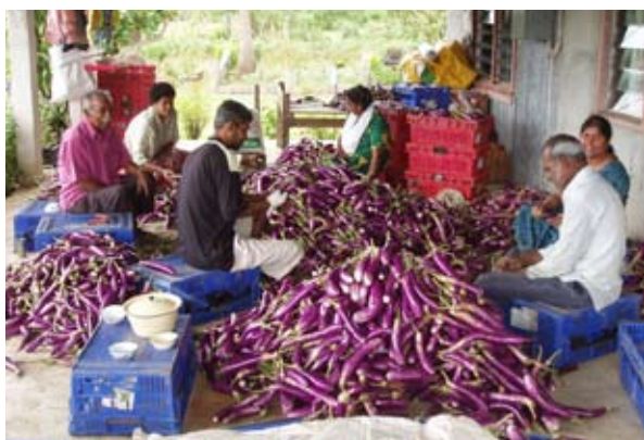
▲ The Technical Mission in Fiji provides production, grading, and packaging technology to farmers.

In general, the TaiwanICDF drafts 10 effective methods of implementation for each project, according to clear goals and strategies: 1) Utilizing Taiwan's strengths in ICT to develop comprehensive international cooperation projects to reduce the digital divide 2) Promoting the growth of agricultural enterprises in order to boost the economy of farming villages and pave the way for sustainable development 3) Nurturing a new generation of individuals to work in the field of international development cooperation, and developing human resources in partner countries 4) Creating an SME investment platform, providing credit guarantees,