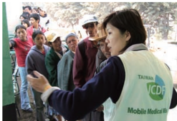
▲ Residents of a village in Guatemala wait to receive health care from doctors with the Mobile Medical Mission.

Taiwan has been successful in eradicating malaria and polio, and it has established a family health planning system. The island also has abundant experience in medical treatment technology and hospital management. All of this experience is highly valued by developing countries that face the threat of malaria, or that have weak disease treatment systems. As a result, the TaiwanICDF has designed its development cooperation strategies and methods to conform to the UN's MDGs. In addition to stationing long-term medical missions at hospitals in partner countries to conduct comprehensive medical services, the TaiwanICDF cooperates with domestic and overseas NGOs and specialized medical institutions to